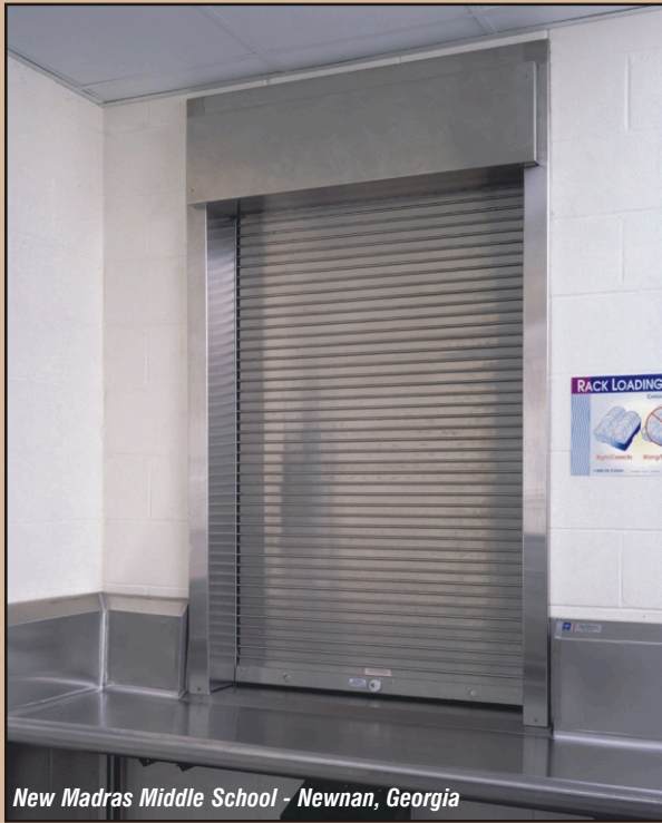
New Madras Middle School - Newnan, Georgia

As with Cookson Service Counter Doors, all FD10 Counter Fire Doors are designed and manufactured as counter doors rather than being constructed of regular fire door components reduced in size to meet counter fire door size requirements. This compact design improves appearance without compromising safety.